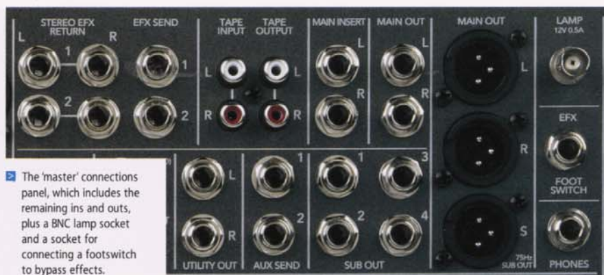
2 The 'master' connections panel, which includes the remaining ins and outs, plus a BNC lamp socket and a socket for connecting a footswitch to bypass effects.

Each of the four Sub faders has Left and Right assign buttons for routing it into the main mix, as mentioned earlier, and there are also Sub output jacks that may be used for